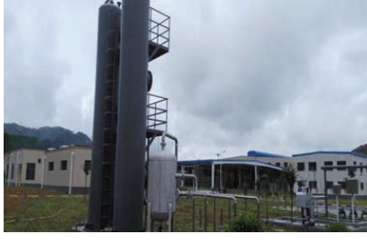
沼气净化加压装置 Biogas purifying compressor