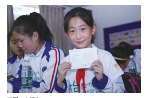
百图小志愿者 A young volunteer of the "100 Library Program"

Moreover, the "100 Library Program" also entered into 35 primary and secondary schools across the country for book collection activities by making full use of the resources in the society. In order to encourage the children to better cherish their books, there were lessons on refurbishing books. In the lessons, the teachers taught the children how to cover their books and the old books could wear "new clothes". The way of collecting books was also more innovative than before. Books were collected in two categories. One category was books on the 100-book list of the "100 Library Program" in 2016 and the other category comprised the remaining books.